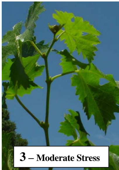
3 - Moderate Stress