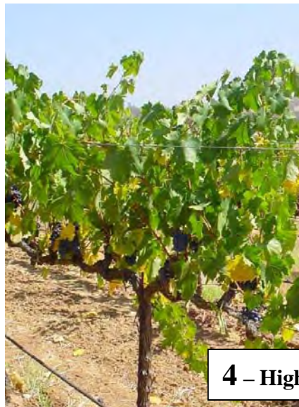
4 - High Stress