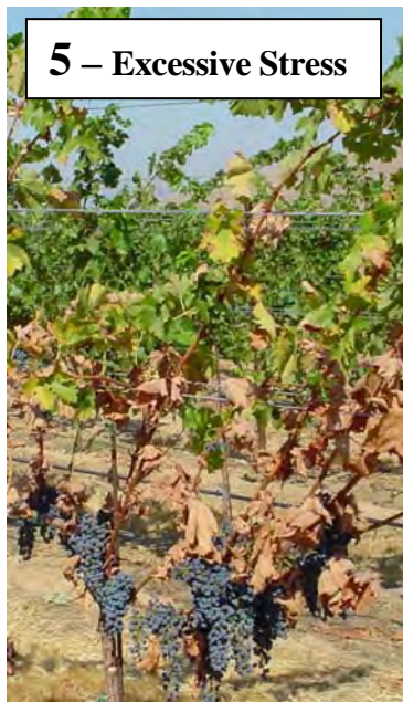
5 - Excessive Stress

Stress Index 0: Tendrils past the tips, vigorous growth.