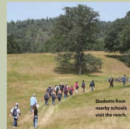
Students from nearby schools visit the ranch.

The Ahlmanns’ commitment to the environment is further evident in their interest in the education of future generations. As participants in the “Acorn Soupe” program, they invite students from community schools to harvest acorns at Six Sigma, which are grown by a local nursery into oak trees and planted back on the ranch the following year.